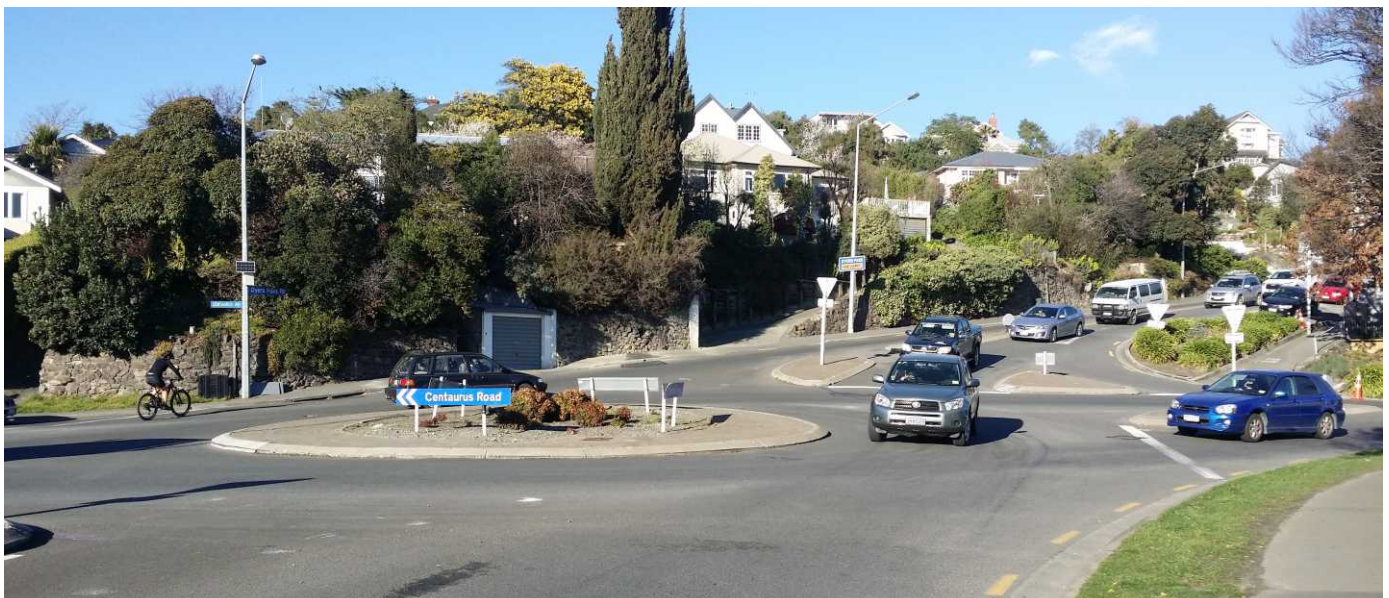
Figure 2: The high operating speeds here make this Christchurch's number 1 cycling hotspot