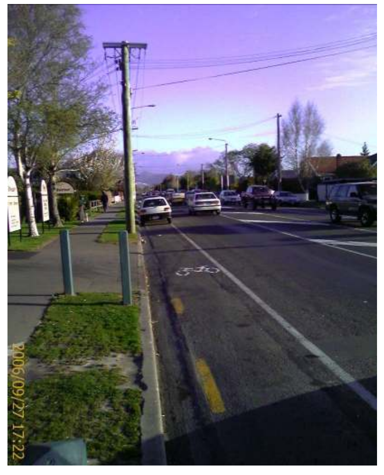
Figure 2: Kerbside cycle lane with BYLs in the foreground, and no BYLs from this point onwards

Removing existing paint is nowhere near economical, so it's not a feasible option either to remove this ambiguity.