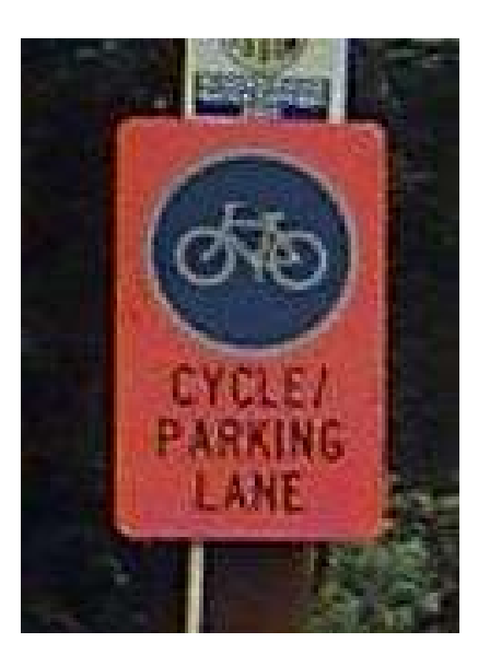
Figure 5: Shared Cycle / Parking Lane sign prior to RUR introduction