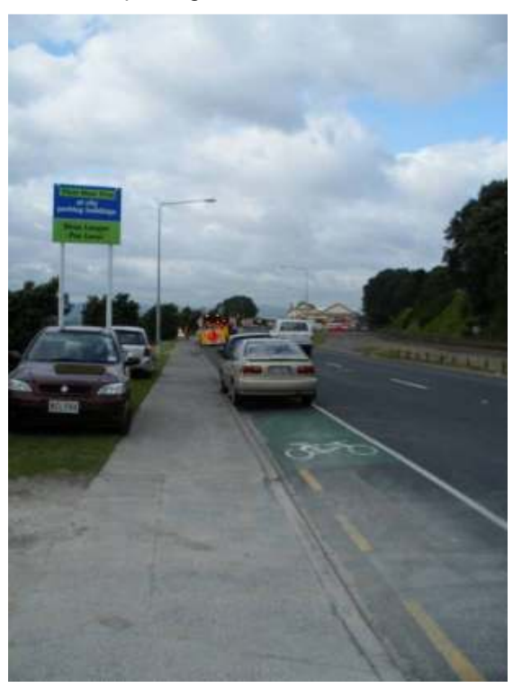
Figure 7: Drivers parking beyond the end of the BYLs

Generally Manukau don't mark BYLs in kerbside cycle lanes. Occasionally BYLs are marked, however it is considered that most kerbside cycle lanes are noticeably narrower than a standard parking lane and therefore most motorists don't confuse them with a parking lane.