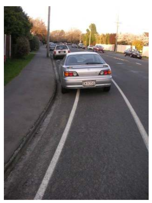
Figure 1: Illegal parking in kerbside cycle lane

The paper concludes that broken yellow lines need to be installed in kerbside cycle lanes if the objective is to keep these lanes free from illegal parking.