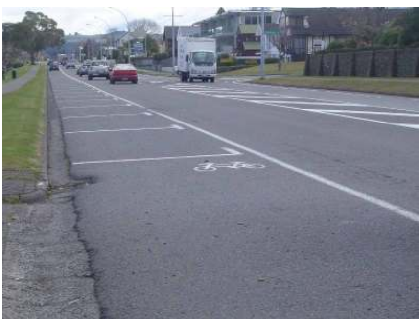
Figure 6: Cycle logo and parking lane

Parking on kerbside cycle lanes was considered an issue on two notable sections. One cycle lane on the State Highway that originally allowed parking also had cycle lane symbols (see Figure 6). Subsequent to the 2005 RUR introduction, the cycle symbols were removed, making it a parking area.