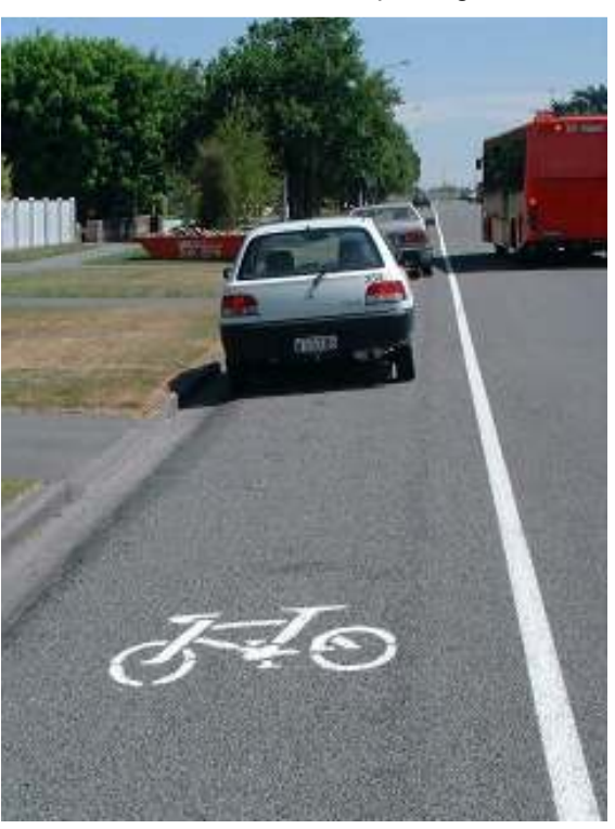
Figure 8: Transit had cycle logos added to the parking lane to make the SH more 'cycle-friendly'