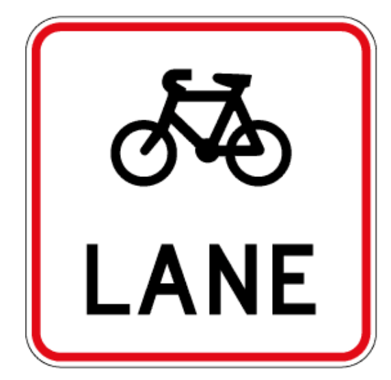
Figure 3: MOTSAM cycle logo