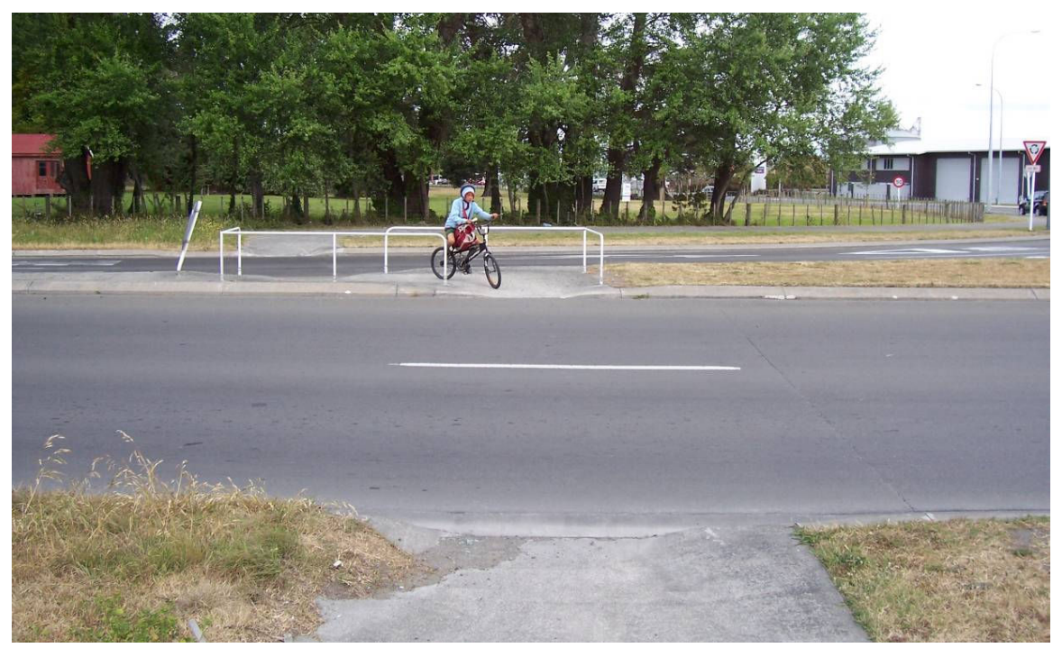
Figure 1: Crossing facility for the 100 km/h road . Roundabout located 30 m to the right.

Pedestrians and cyclists crossing the 100 km/h road are provided for by off-road crossings away from the roundabout (as shown in Figure 1) and off-road paths around the outside of the roundabout linking to the 50 km/h road. The pedestrian and cycle crossing facilities are located some 30 m away from the roundabout's circulating roadway.